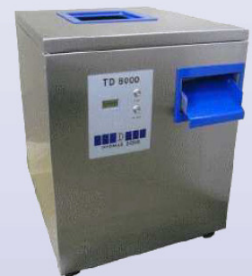
Cutlery polishing machine TD 8000